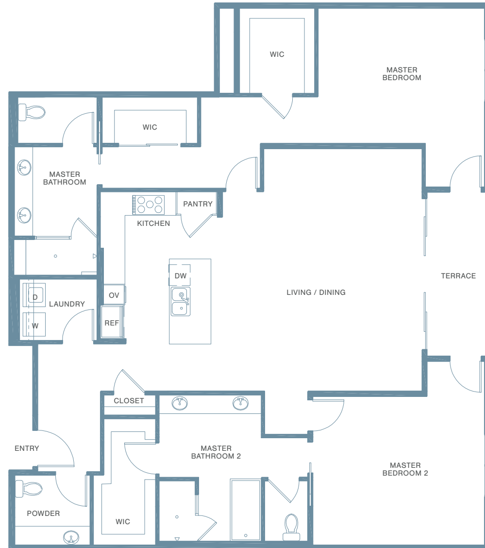
SECOND OR THIRD LEVEL