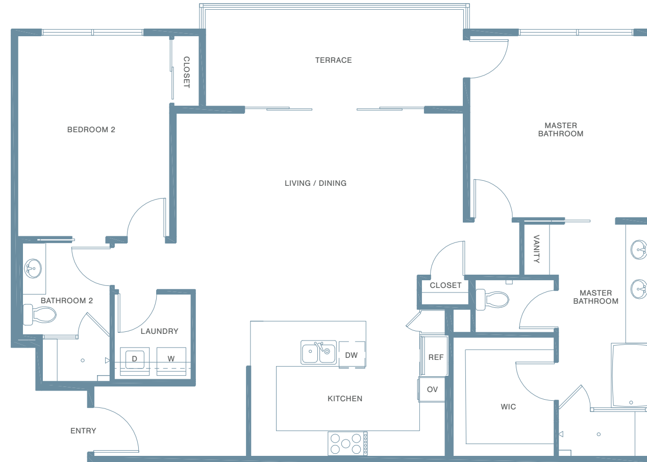
SECOND OR THIRD LEVEL